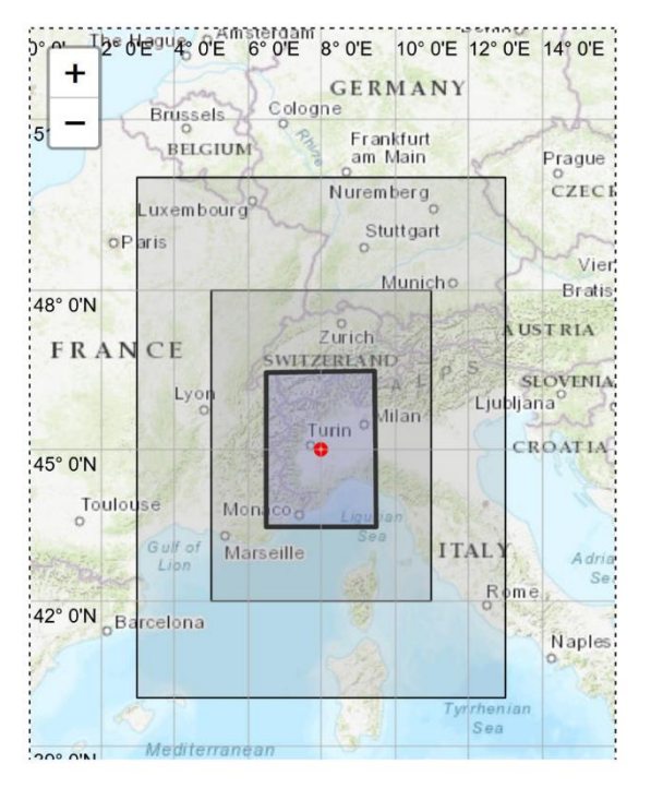
Fig.2: domain of the simulations (inner shaded area).

With this workplan I will use about 900000 SBU (roughly).